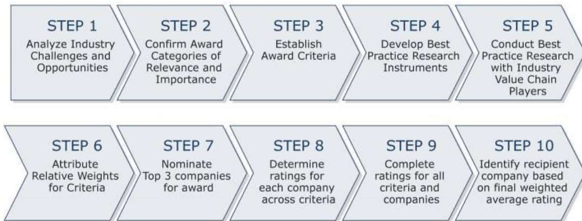
Chart 2: Frost & Sullivan’s 10-Step Process for Identifying Award Recipients