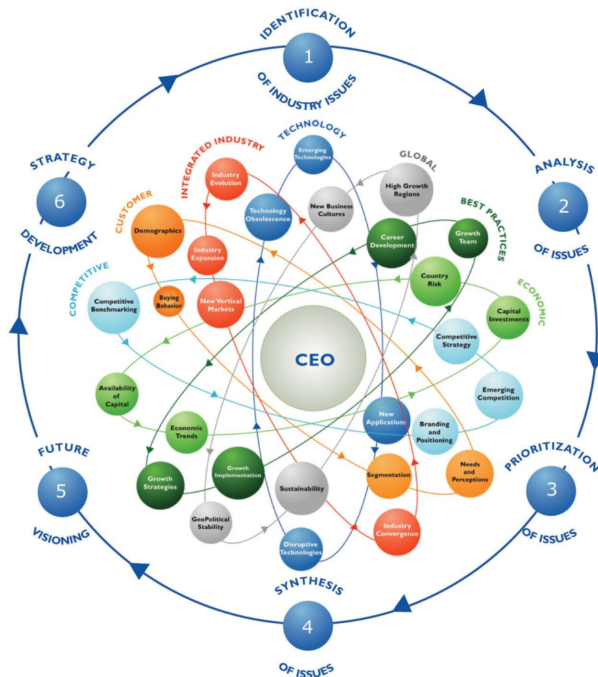
Chart 4: The CEO's 360-Degree Perspective™ Model

The CEO 360-Degree Perspective™ model enables our clients to gain a comprehensive, action-oriented understanding of market evolution and its implications for their companies' growth strategies. As illustrated in Chart 5 below, the following six-step process outlines how our researchers and consultants embed the CEO 360-Degree Perspective™ into their analyses and recommendations.